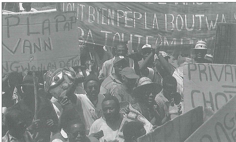
Demonstrators against privatisation with banners which read "The people are not going to sell".

S tructural adjustment legislation to privatise nine state-owned enterprises, and reduce the number of state employees has finally been passed by the Haitian Parliament. The actual casting of votes on these two controversial laws did much to discredit the image of parliamentary democracy. Some highly principled parliamentarians participated in the debates and voted or abstained in the votes. Sadly a much larger number (approximately 40% of the total number of parliamentarians) did not present themselves at all at the time of voting, presumably because they did not want take a position on laws that have been strongly promoted by the executive and strongly criticised by progressive organisations from the popular movement.