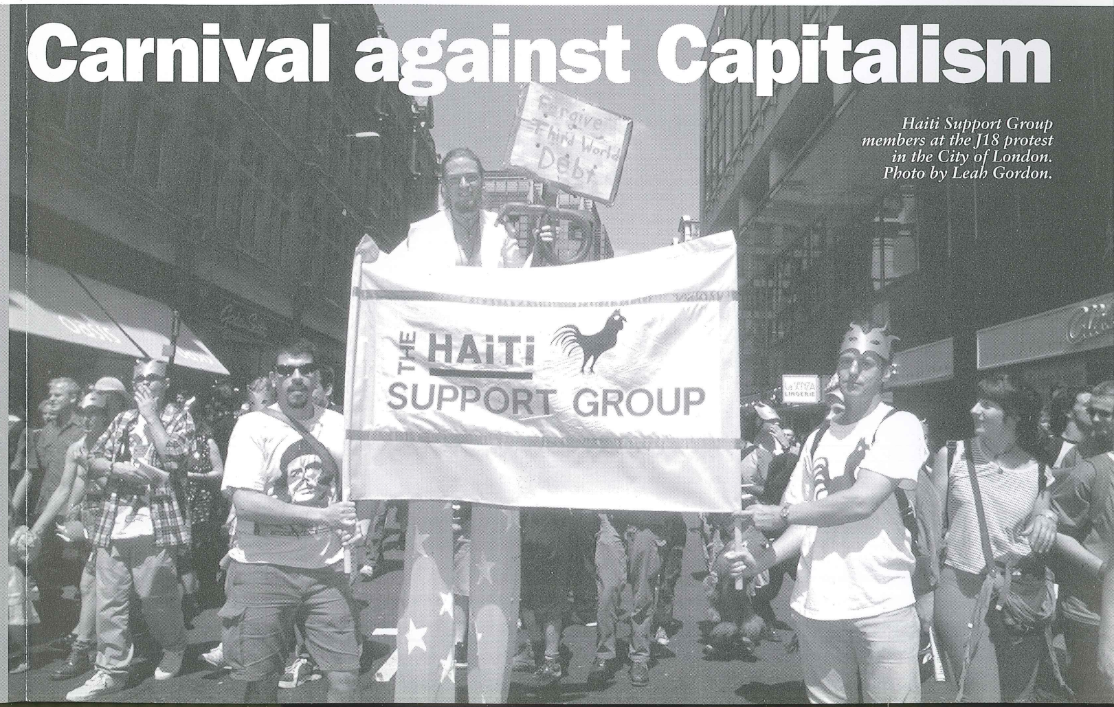
Haiti Support Group members at the J18 protest in the City of London.