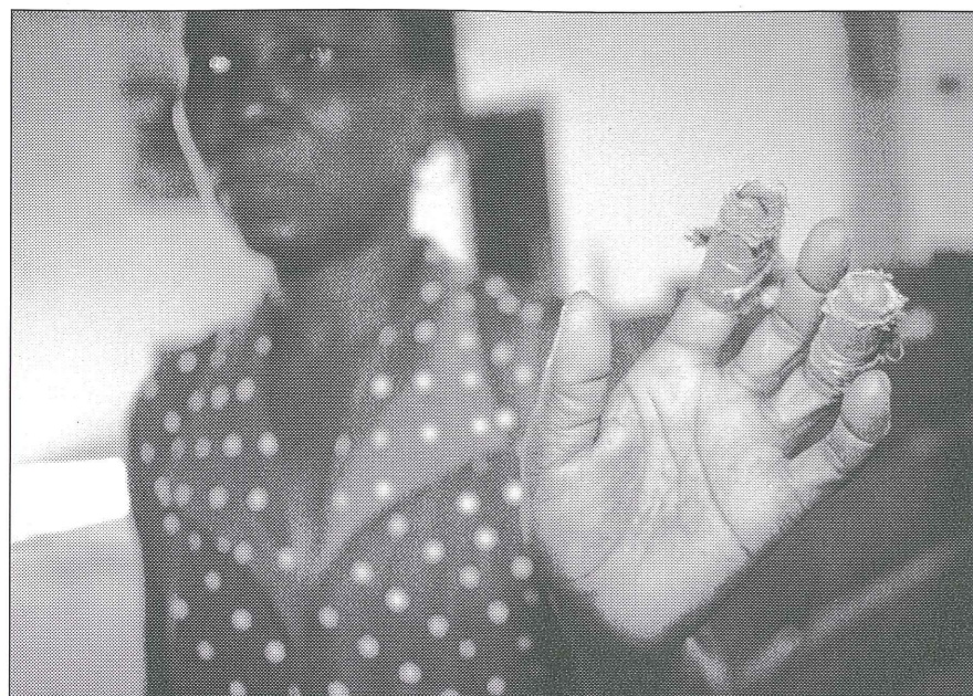
Hand of an orange cutter at the Guacimal plant at Madeline.