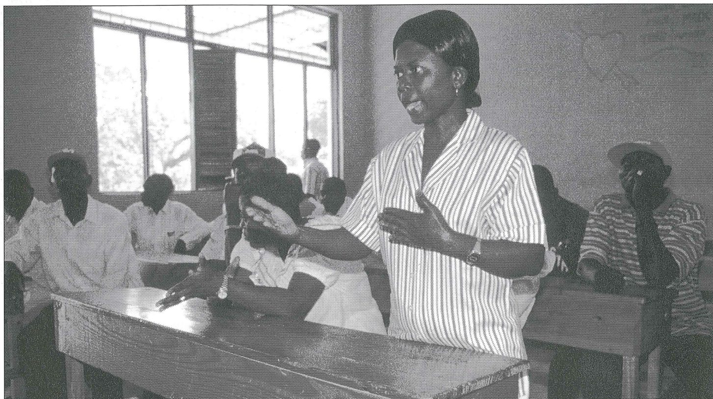
Meeting of the Novella Establishment Workers' Union in Cap-Haitien. Workers, peasant and neighbourhood organisations are the key to genuine democracy in Haiti.