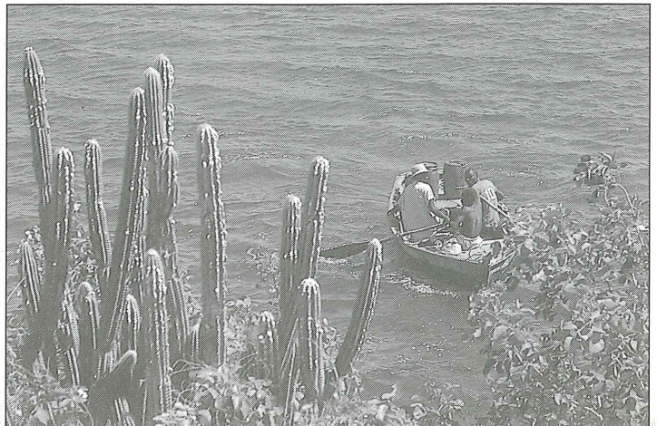
Petrol being smuggled across Etang Saumâtre lake between Haiti and the Dominican Republic.