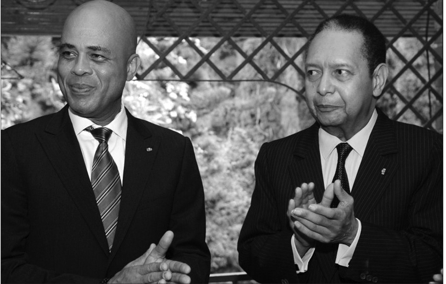
Mutual appreciation society. President Michel Martelly seeks advice on how to run Haiti as a dictatorship from Haiti's ousted former President for Life, Jean-Claude Duvalier, Port-au-Prince, October 2011.

Duvalier Departs, but Martelly's Duvalierism Marches On