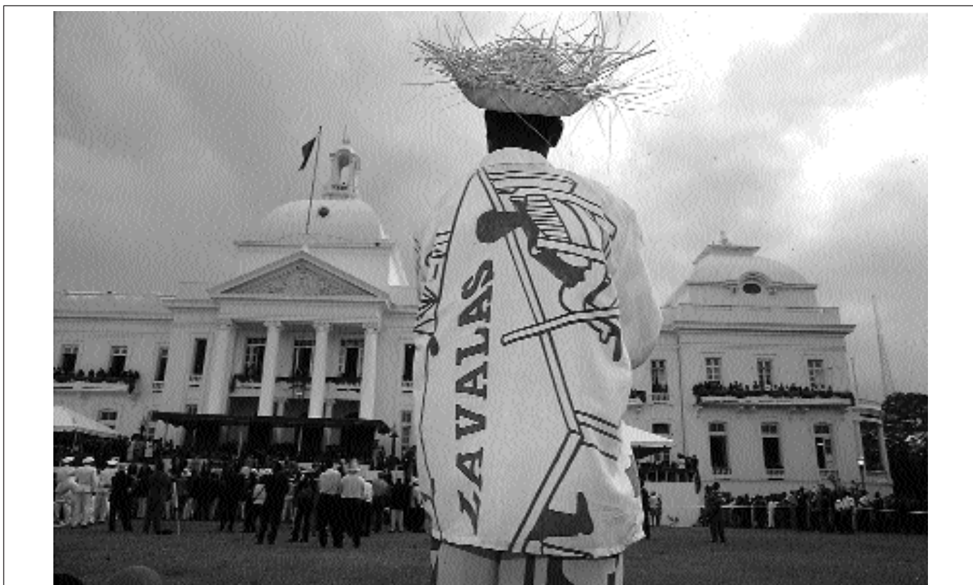
What's left of Lavalas - looking for answers, Préval's inauguration, National Palace, 7th February 1996