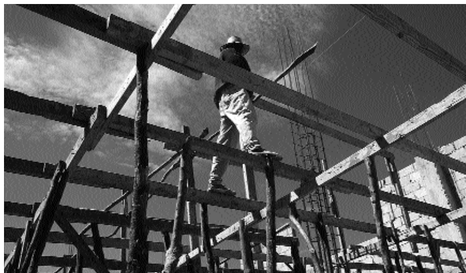
Building Libète's new premises in Port-au-Prince.

The new building which should be ready by the end of April will be run in conjunction with two other publishers. They are the Haitian non-government organisation, CRESFED, which publishes the bi-monthly revue, Rencontre , and the