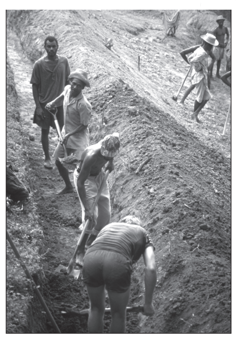
Anglo-Haitian 'konbit' (work brigade) digging anti-soil erosion ditches.

To someone used to pen-pushing in an air-conditioned office back in London, the work was very strenuous, and there was a real possibility of suffering heat exhaustion under the intense Caribbean sun. I could only marvel at the camaraderie of these people enduring these conditions on a daily basis and witnessing the diminshing returns of their efforts year by year.