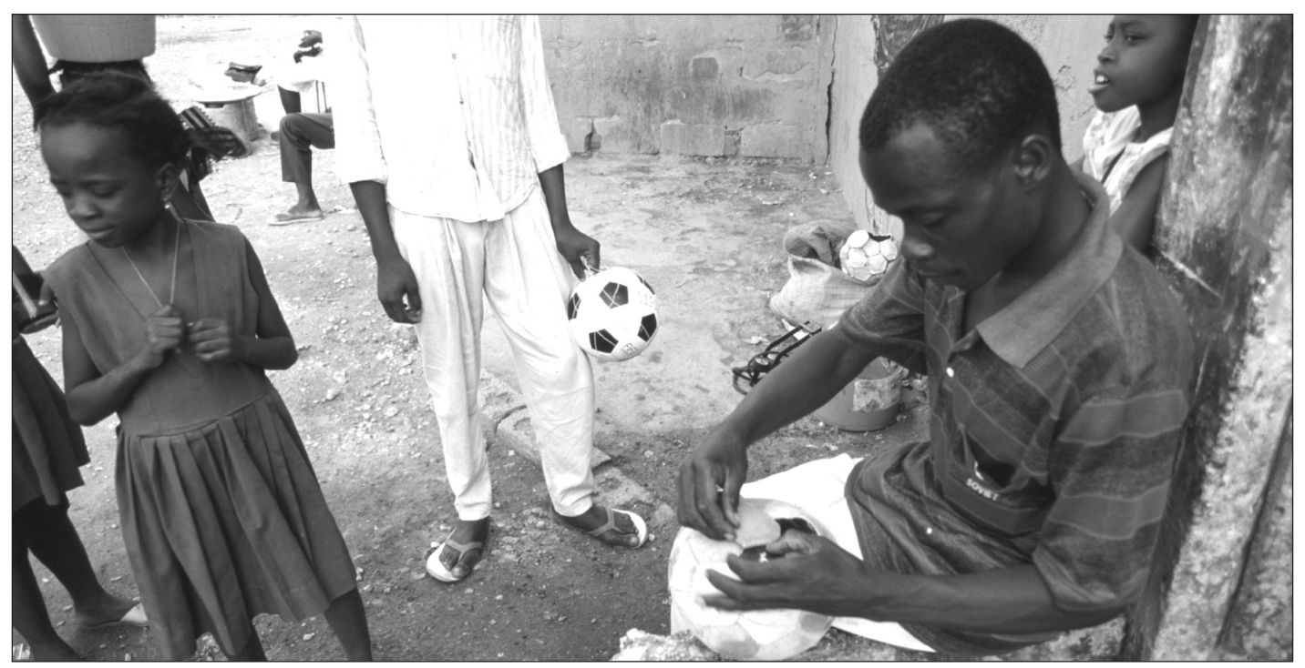
Street workshop for those essential football repairs