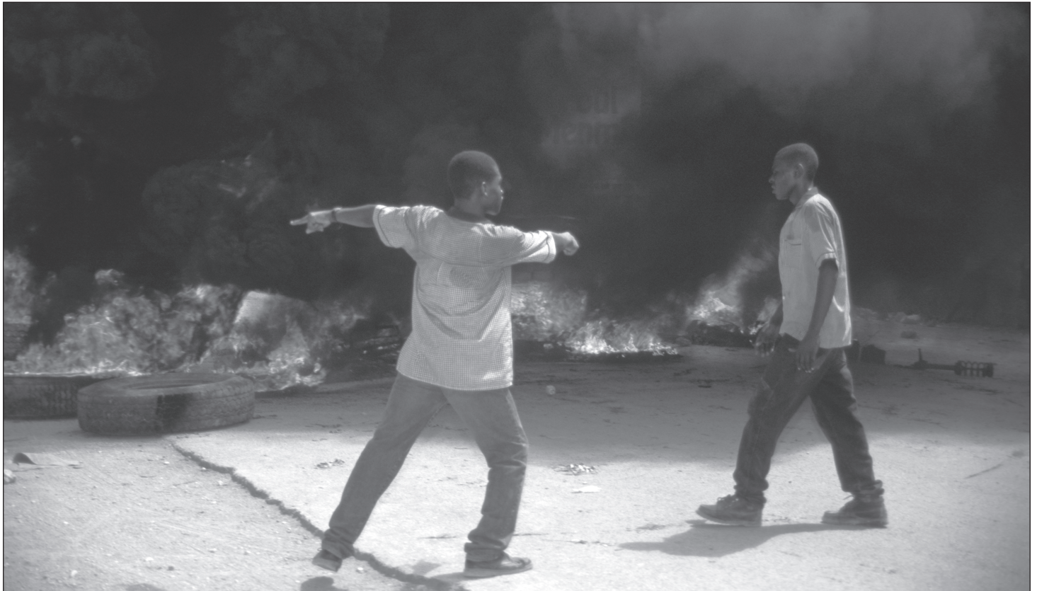
Burning tyre roadblock demonstrations against the government occur almost daily