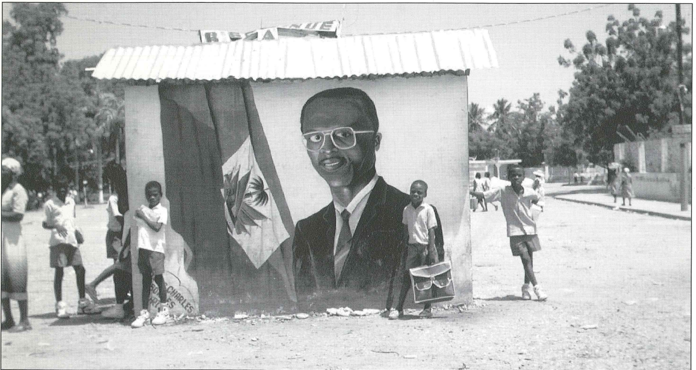
Aristide mural - Léogâne 1991. Here we go again.