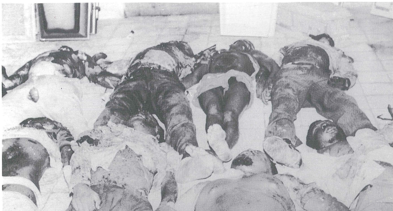
The results of another night of army rule. Port-au-Prince General Hospital