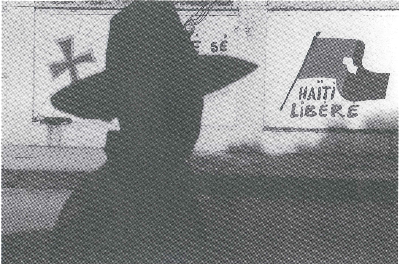
Liberation mural in Port-au-Prince.