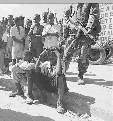
Incident of petty theft – UN 'peace-keepers' in Port-au-Prince.

4 Neo-liberal policies promoting free trade by cutting and eliminating import tariffs mean that peasants growing sugar cane (for the production of clarin – raw rum) and plantains are finding their products undercut by foreign imports that are flooding Haiti's markets.