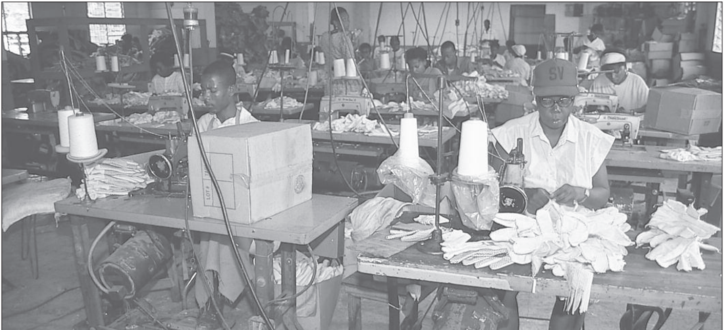
Twenty thousand Haitians, mostly women, work in export assembly plants where they earn less than 20p an hour.