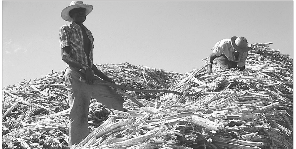
Sugar cane farmers near Léogâne. Until recently Haiti exported sugar but all the commercial cane refineries were closed by the owners who could make bigger profits from importing sugar. Now even local rum production is threatened by tariff-exempt ethanol imports.

Reprinted from the weekly newspaper Haiti Progrès – 30 October 1996.