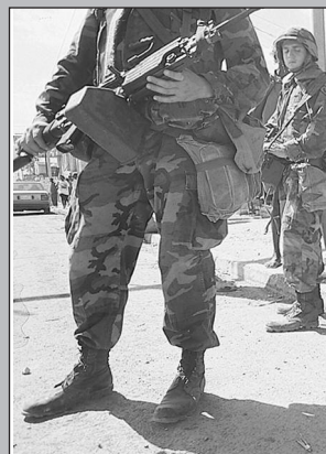
US troops with boys accusing in action.

litical group popular and already rejected has already doesn't count this arrogant Lavalas author a road to die 3) All the victims are suffering arrests of tr