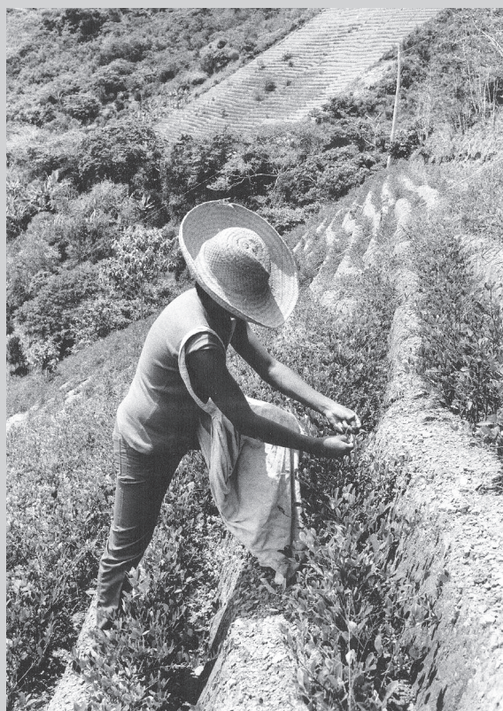
Peasant picking coca leaves in Bolivia

The origins of the fierce brutality inherent in this trade lie in Colombia's turbulent history. In the late forties and fifties there existed a violent rivalry between the Liberal and Conservative parties, known as La Violencia. Over 250,000 people died during this decade which ended with the formation of an alliance called the National Front. The agreement guaranteed that no other political force other than the Liberals or Conservatives would have any access to power. When the