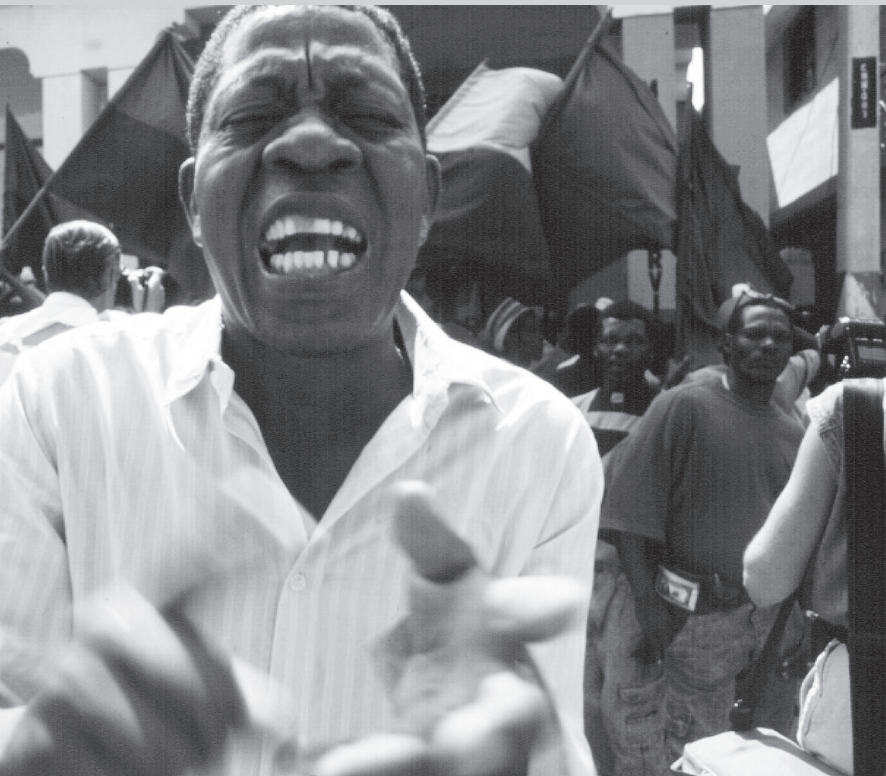
illed by cocaine in 1993 (Leah Gordon)

pressure from the Drug En- and competition with local meant that the traffickers e Caribbean corridor for an